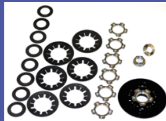
Extensive parts enable optimal tuning and adjustment.